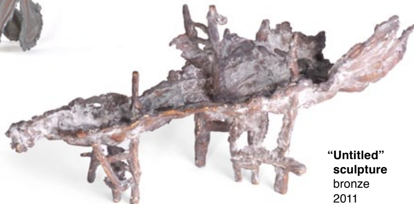
"Untitled" sculpture bronze 2011