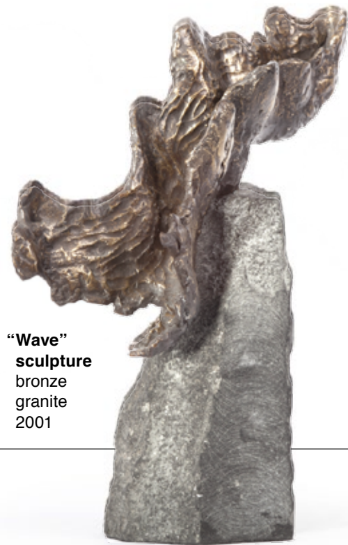
"Wave" sculpture bronze granite 2001